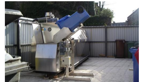
The bin lift makes it easier to handle large volumes of food waste. Talbot Hotel in Wexford, Ireland has a bin lift for their model T240.