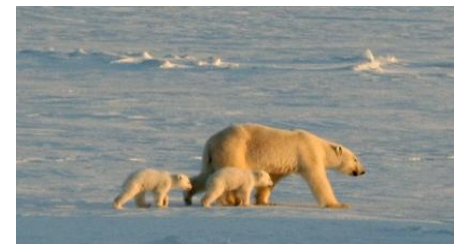
The environmental reasons are obvious, less transportation and small scale handling on-site leave a smaller carbon footprint.

Our customers all have very high requirements on the economical and practical handling of their food waste. We have a vast experience from our many installations and can make sure that the chain from food waste to compost works as simply as possible. A binlift and a hopper fed inlet are some of the options which make it possible to adjust Big Hanna to your needs. Contact us for a visit, to take you to see a machine or for more information.