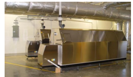
'Sustainable Initiatives' in Ohio prisons include on-site composting at Noble Correctional Institution in Caldwell, OH, USA.

Head office: Sockerbruket 25, 414 51 Göteborg, Sweden Phone US: (+1)740-365-4140 · E-mail: info@susteco.se · Skype name: bighannacomposter