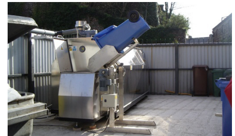
The bin lift makes it easier to handle large volumes of food waste. Talbot Hotel in Wexford, Ireland has a binlift for their model T240.