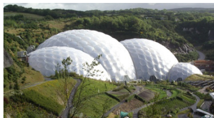
The Eden Project in Cornwall, UK has a larger version of a Big Hanna called Neter. They have been composting on-site since 2005.