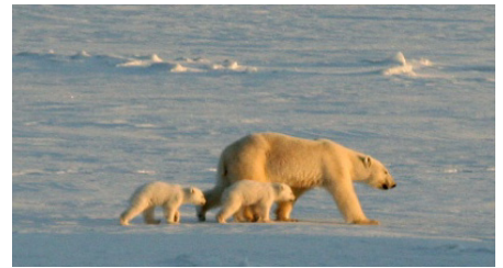
The environmental reasons are obvious, less transportation and small scale handling on-site leave a smaller carbon footprint. Picture from Kingsbay A/S, Svalbard where the research station is composting with Big Hanna.

Contact us for a visit, to take you to see a machine or for more information.